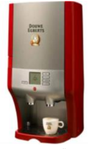
Douwe Egbert® are resisted trademarks of Sara Lee